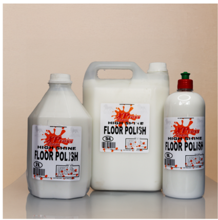
WHITE FLOOR POLISH Sizes: 1KG | 2KG | 5KG | 25KG