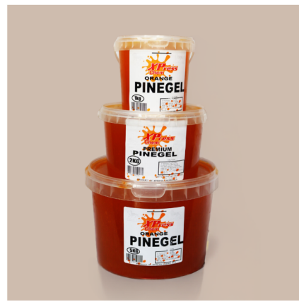
PINEGEL ECONO B GRADE Sizes: 1KG | 2KG | 5KG | 25KG