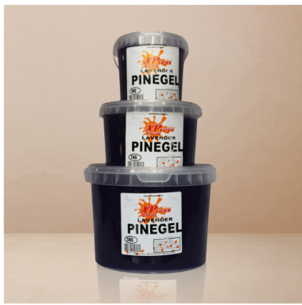
PINEGEL PREMIUM A GRADE Sizes: 1KG | 2KG | 5KG | 25KG