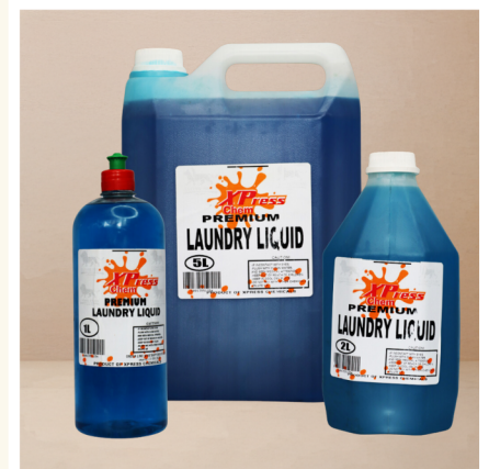
LAUNDRY LIQUID Sizes: 1L | 2L | 5L | 25L