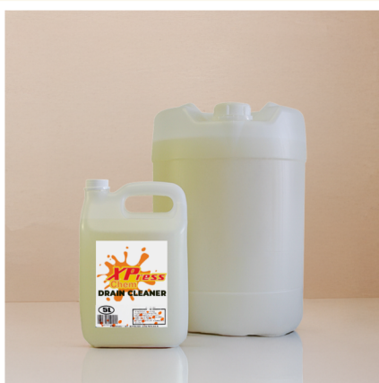
DRAIN CLEANER Sizes: 1L | 2L | 5L | 25L