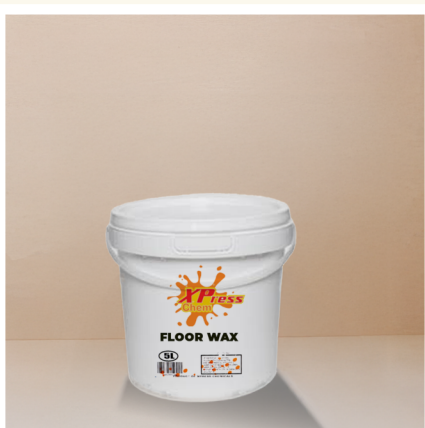
FLOOR WAX Sizes: 1L | 2L | 5L | 25L