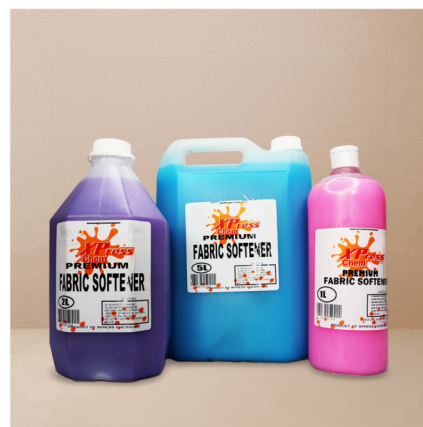
FABRIC SOFTENER Sizes: 1L | 2L | 5L | 25L