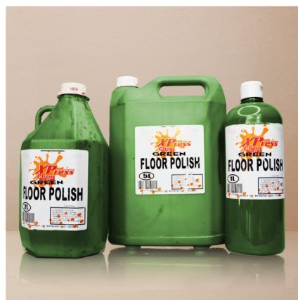
GREEN FLOOR POLISH Sizes: 1L | 2L | 5L | 25L