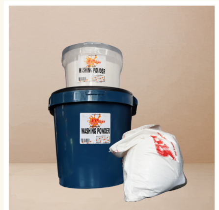
WASHING POWDER Sizes: 1L | 2L | 5L | 25L