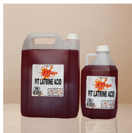
PIT LATRINE ACID Sizes: 1L | 2L | 5L | 25L