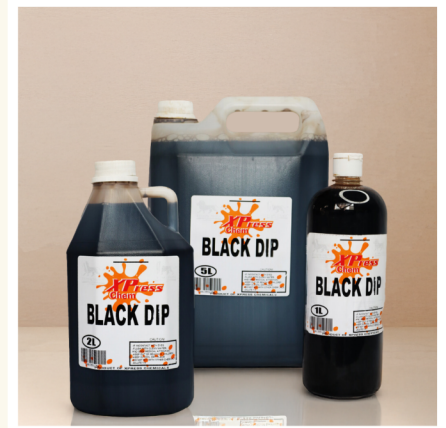
BLACK DIP Sizes: 1L | 2L | 5L | 25L