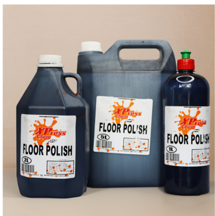
GREY FLOOR POLISH Sizes: 1L | 2L | 5L | 25L