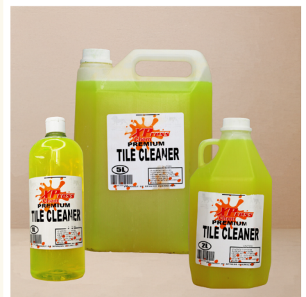
FLOOR TILE CLEANER Sizes: 1L | 2L | 5L | 25L