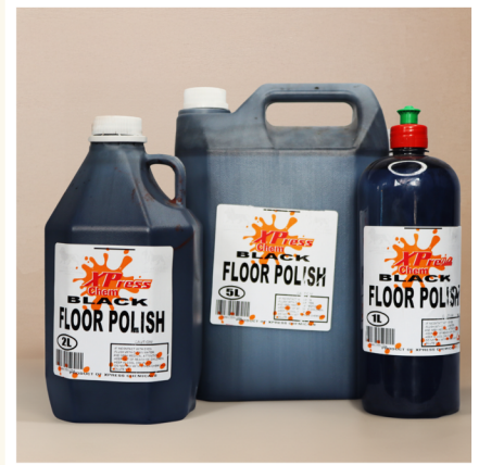
BLACK FLOOR POLISH Sizes: 1L | 2L | 5L | 25L