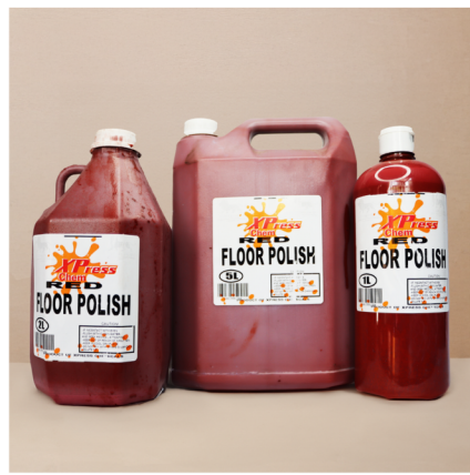
RED FLOOR POLISH Sizes: 1KG | 2KG | 5KG | 25KG