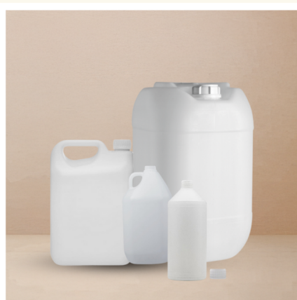
FLOOR STRIPPER Sizes: 1L | 2L | 5L | 25L