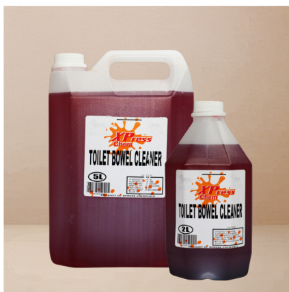
TOILET BOWL CLEANER Sizes: 1L | 2L | 5L | 25L